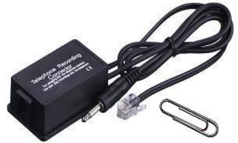
Call Recorder hardware Compact, Discreet, Easy to Install

Recording your telephone calls is a breeze. Simply click the tab in GoldMine® or the Call Recorder icon in your system tray.